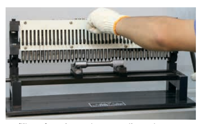
Profiling of test bars prior to tensile testing