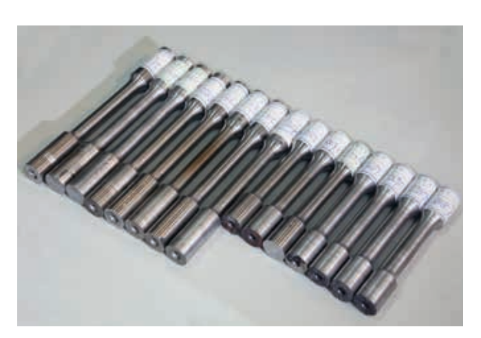
Precision machined test bars in accordance with ASTM A-370