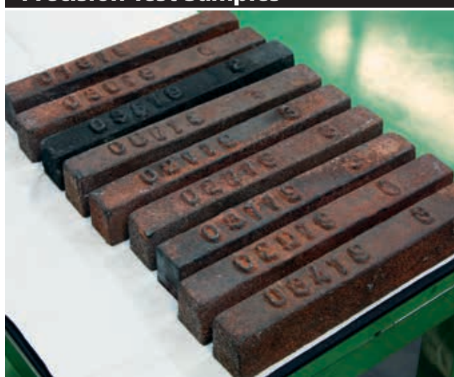
Cast Bars with full traceability to heat numbers