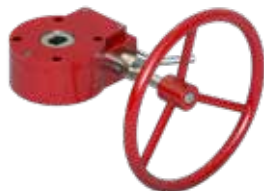
Bray Series 04, 05