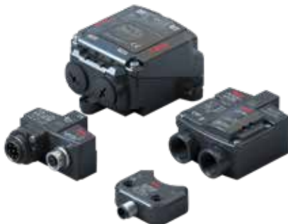
Bray Series 54 SIL 2 Capable