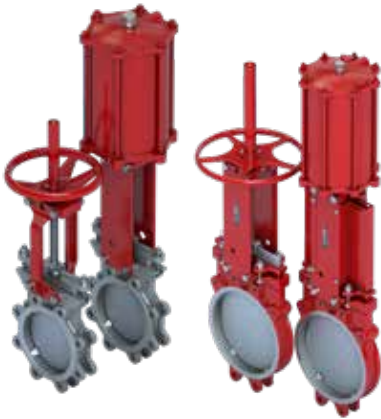
Bray Series 940, 950