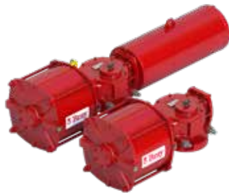
Bray Series 98 Pneumatic SIL 3 Capable