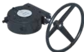
Bray Series FTG