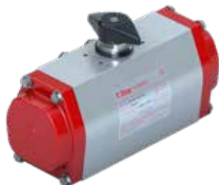
Bray Series 92/93 SIL 3 Capable