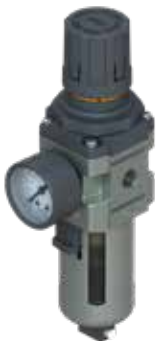
Bray Series 55