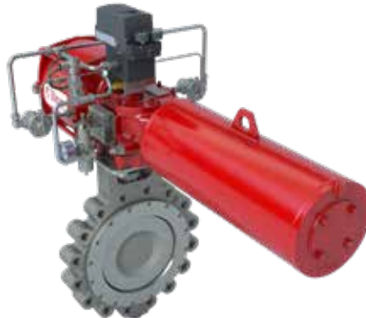
High Performance Butterfly Valves