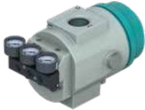
Bray Series 6A Explosion Proof SIL 2 Capable