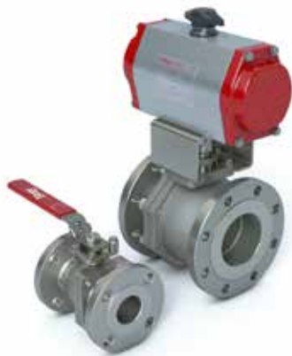
Bray Series RF15/RF30, F15/F30 SIL 3 Capable