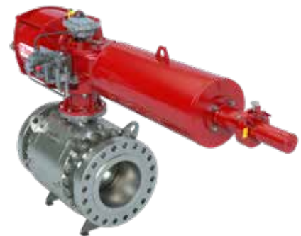
Trunnion Mounted Ball Valves