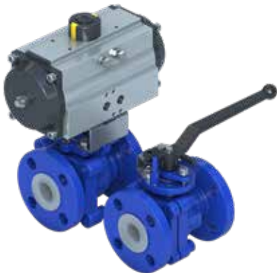
Amresist Acris SIL 3 Capable (Full Port)