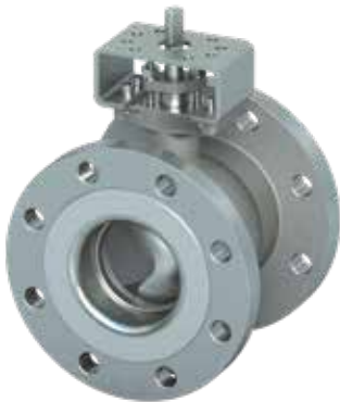
Bray Series 19