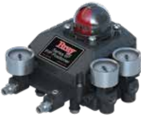
Bray Series 6P SIL 2 Capable