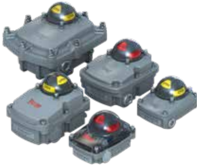
Bray Series 5A, 5B, 5C + Optional Resin Housing