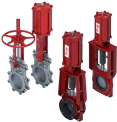
Bray Series 740, 762, 768