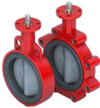
Bray Series 30/31 SIL 3 Capable