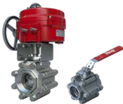
Bray Triad Series SIL 3 Capable