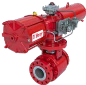
Metal Seated Ball Valves