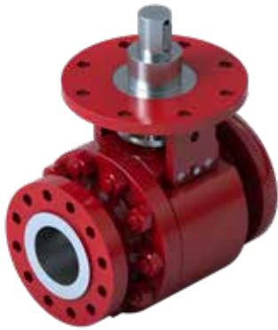
Bray Series M1 SIL 3 Capable