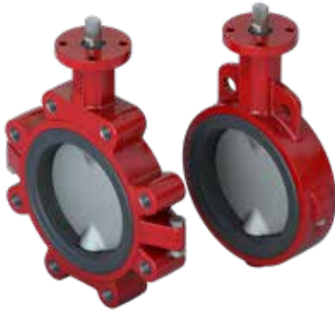
Bray Series 20/21 SIL 3 Capable