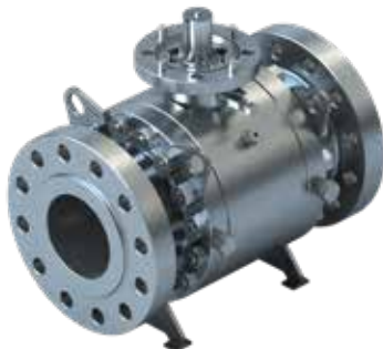
Bray Series 1B SIL 3 Capable