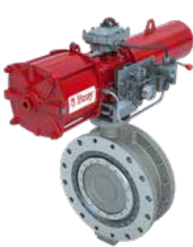
Triple Offset Butterfly Valves