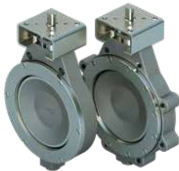
McCannalok SIL 3 Capable