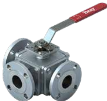
Bray Series MP