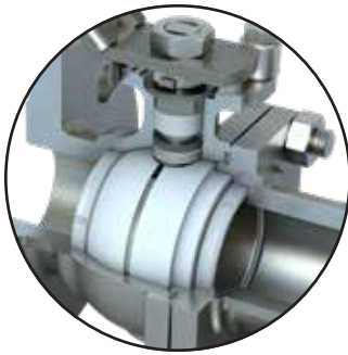
Bray Body Cavity Fillers