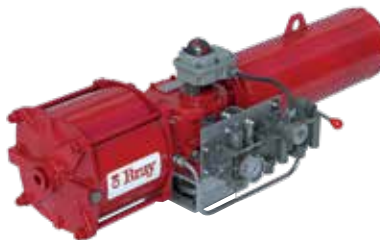
Scotch Yoke Pneumatic Actuators