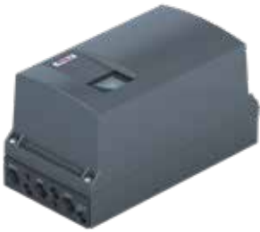
Bray Series 6A SIL 2 Capable