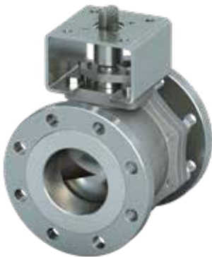
Bray V-Control SIL 3 Capable