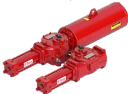
Bray Series 98 Hydraulic SIL 3 Capable