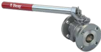
Bray Series SRH