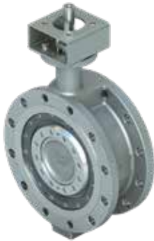
Tri Lok SIL 3 Capable