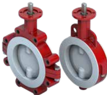
Bray Series 22/23 SIL 3 Capable