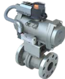
Flanged Ball Valves