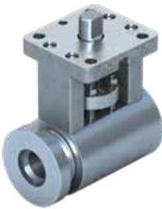
Bray Series M4