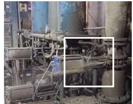
Body and packing leaks.