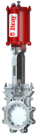
Bray Series 942 Recycle/Reject Vortex Knife Gate valve.