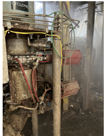
Bray Series 942 Recycle/Reject Vortex Knife Gate valve in cyclone service.